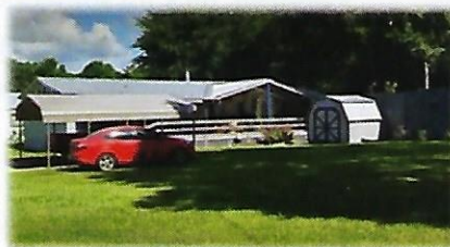
June 2019 9294 Everwood