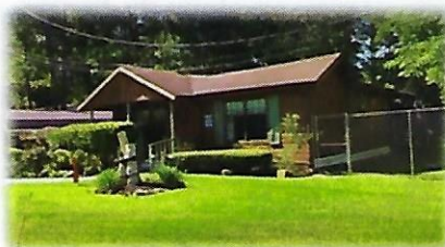
April 2019 9579 Darkwood