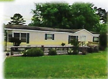
May 2019 11185 Apple Tree